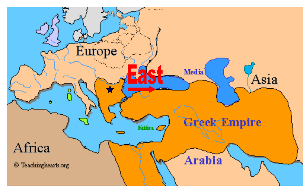
Figure 2: Expansion of the Grecian Empire

We learn that the goat comes from the West. In Figure 2 below, we can see the progression of the Grecian Empire from the West to the East. Alexander the Great is noted as a famous military general because of the speed in which he conquered his empire. He began by defeating the Medo-Persians in 334 at 21 years of age and expanded his territory to include the entirety of the Medo-Persian Empire, Greece, and additional parts of Saudi Arabia. He died at the ripe old age of 33 after reportedly grieving that there were no more worlds to conquer.